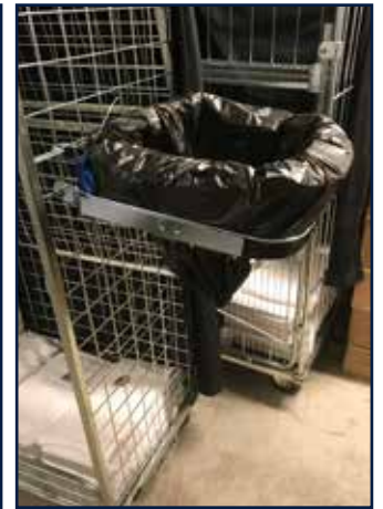
MIDI (Item no. 34350 / 34355)

Height..... 159mm Width..... 374mm Depth .....264mm Opening.....284x164mm