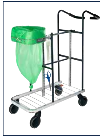
MINI (Item no. 34300)

Height..... 159mm Width..... 374mm Depth .....264mm Opening.....284x164mm